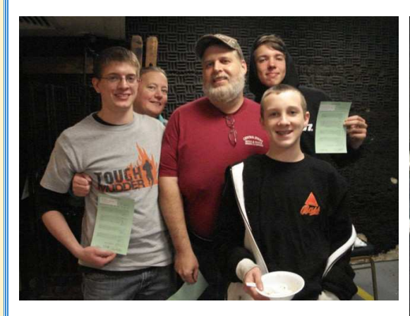
The Rotando Family Shooters